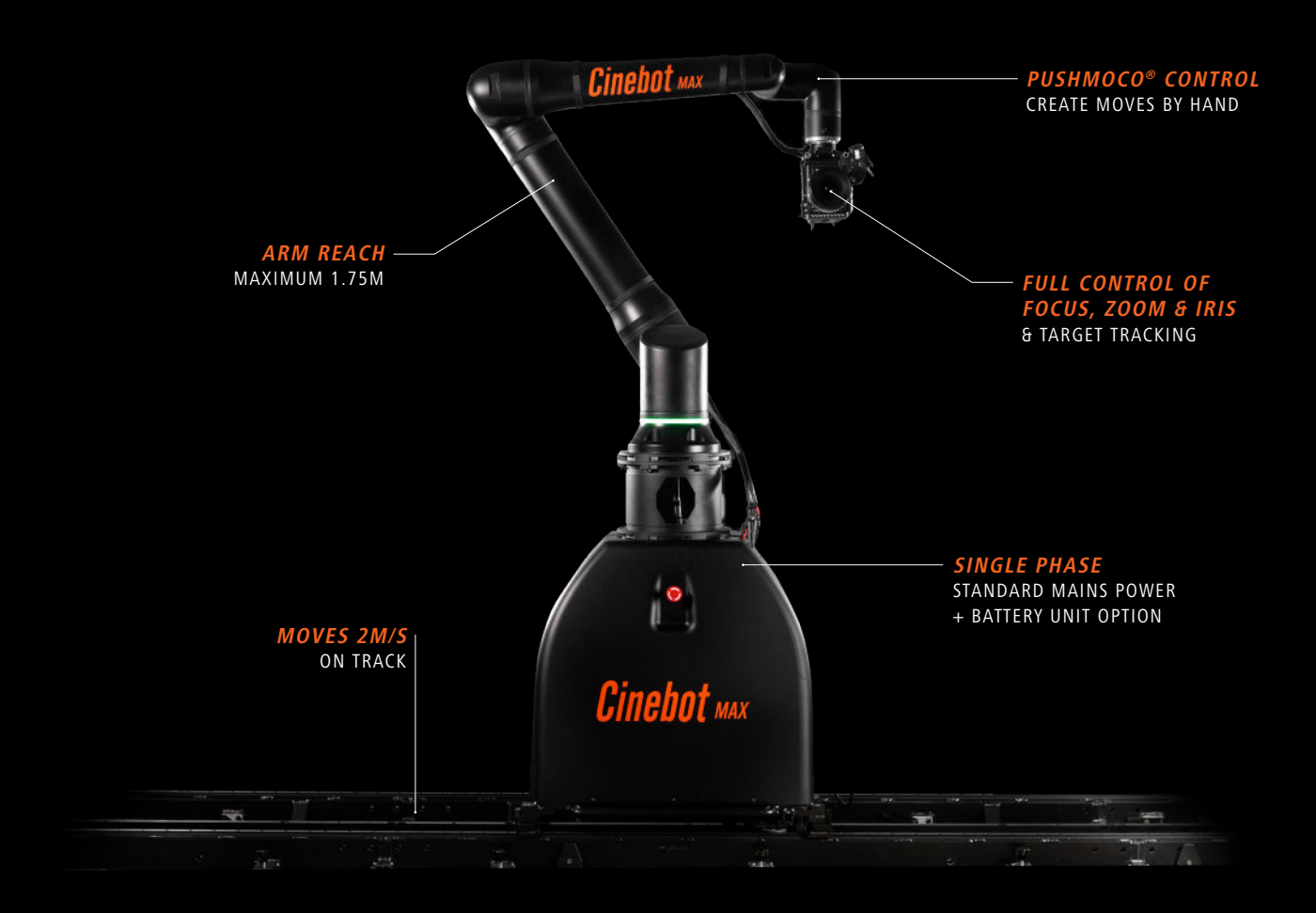
MAXIMUM REACH (M

Harness the power of PushMoco® with the Cinebot Max, the latest innovation to our Cinebot lineup. Building upon the success of the popular Cinebot Mini, the Cinebot Max offers all the control and versatility you would expect, but scaled up to the MAX. Designed for hands-on keyframing, the Cinebot Max boasts an extended range of motion, reaching heights of 3.2m and an impressive payload capacity of up to 20kg, whilst remaining user-friendly and portable for on-location shoots and studio work.