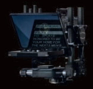
OPTIONAL ROLL SUPPORT